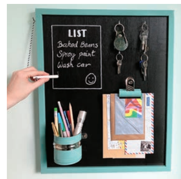
DIY Command Centre

Do It With Cans, promotes the benefits of metal packaging products for DIY and craft projects. In response to the cost-of-living crisis, our Easy Ways to Refresh a Rented House campaign offered renters budget-friendly DIY ideas to enhance their homes without permanent changes. Featuring tutorials like a bathroom cabinet glow-up, shabby chic furniture painting, custom wall mural, DIY command centre, and jute runner rug, the campaign inspired creativity while keeping costs low.