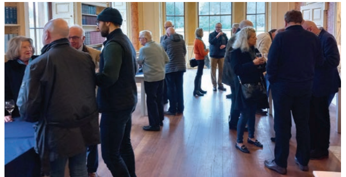
Drinks at Wentworth Woodhouse