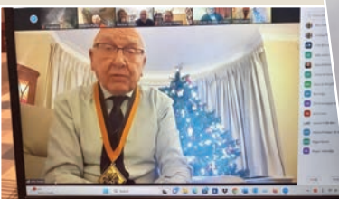
Keeping in touch by Zoom