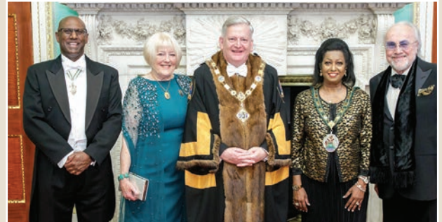
Welcoming guests from other Companies