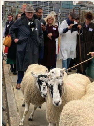
The Sheep Drive on Southwark Bridge