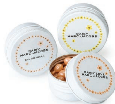
Daisy Drops, Marc Jacobs

industry's highest recognition – the Best in Metal Award 2024 – for its collaboration with Marc Jacobs.