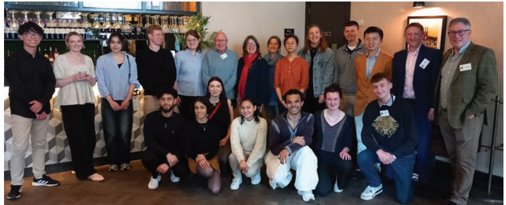
The Yeoman Meet, April 2024

Since 2019 we have invited all our prize-winners to stay in contact with the Company by becoming a Yeoman. This year around 35 of our latest prize-winners took up this invitation, and we now have more than seventy Yeomen. There is no charge for membership in the first year. It gives our prize-winners an opportunity to learn something about us, and