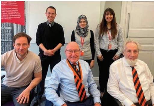
The judges and prize-winners

Since the 1990s we have awarded bursaries to enable graduate students at City University to present their research at international conferences.