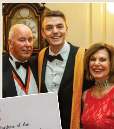
Welcoming new members