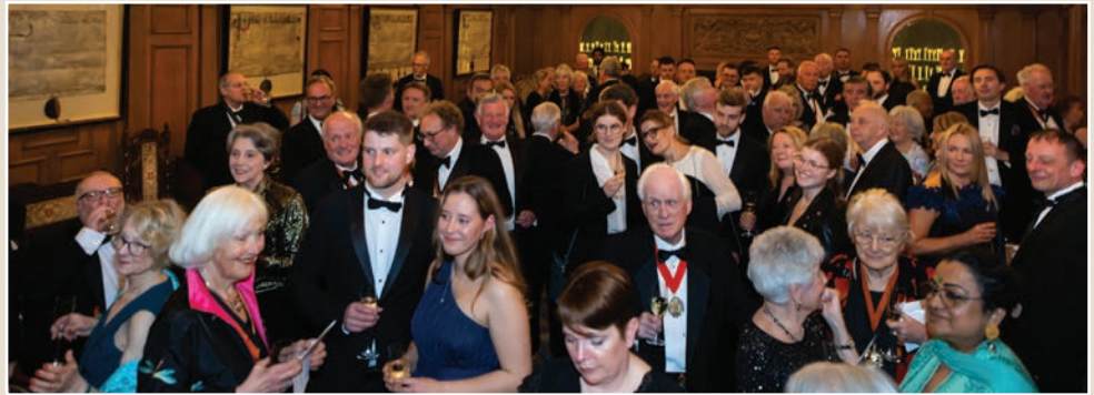
Good company at Vintners' Hall