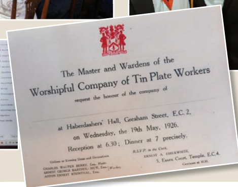
Cherishing our history