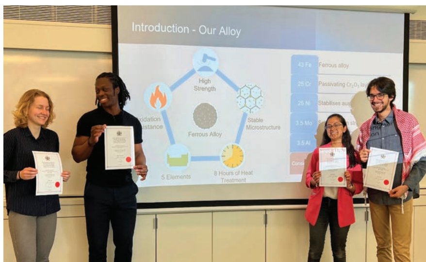
Cambridge Best Poster team