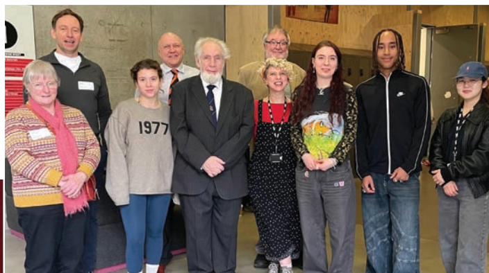
The judging panel and 2nd Year finalists