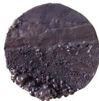
Morven Aird, ‘Tidal Trash’, obverse