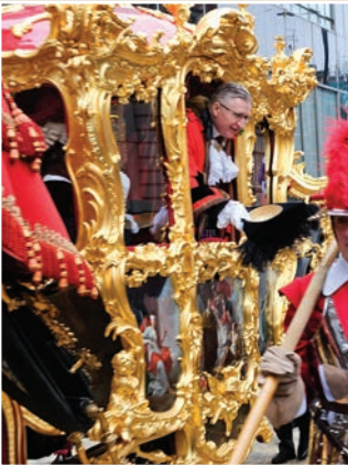
The Lord Mayor's Show