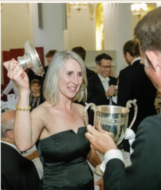
Passing the Loving Cup