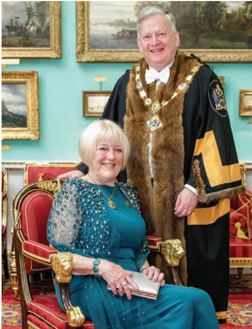
The Master and Jean Spencer.