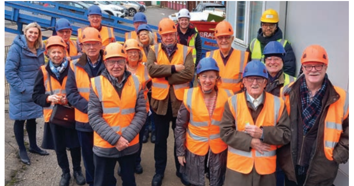
Visit to ArcelorMittal in Sheffield