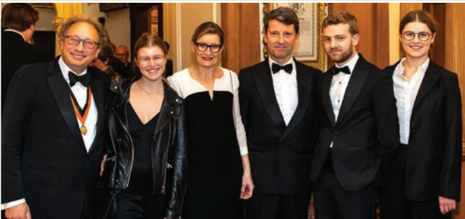
An enjoyable evening out