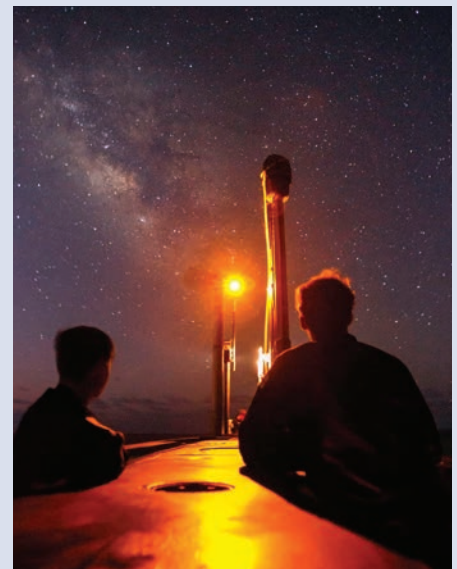
Off the East coast of the USA