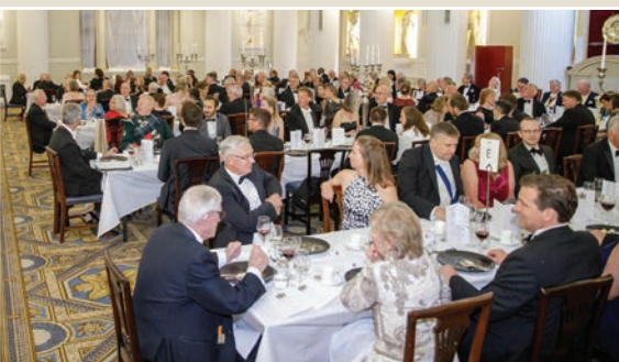
Fine dining at Mansion House